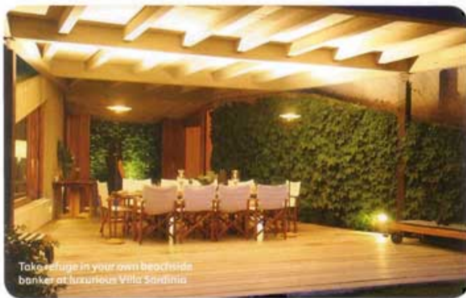
Take refuge in your own beachside bunker at luxurious Villa Sardinia