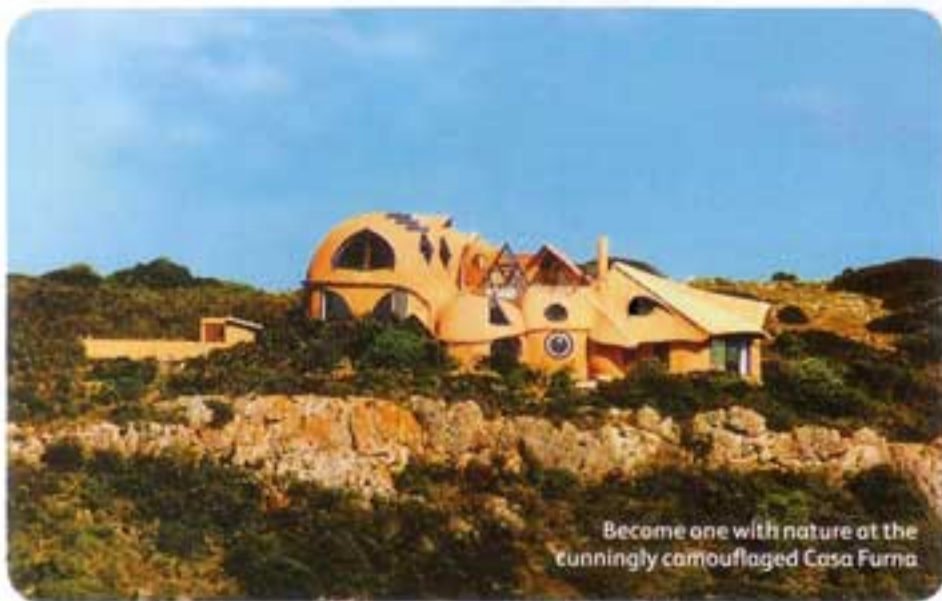
Become one with nature at the cunningly camouflaged Casa Furna