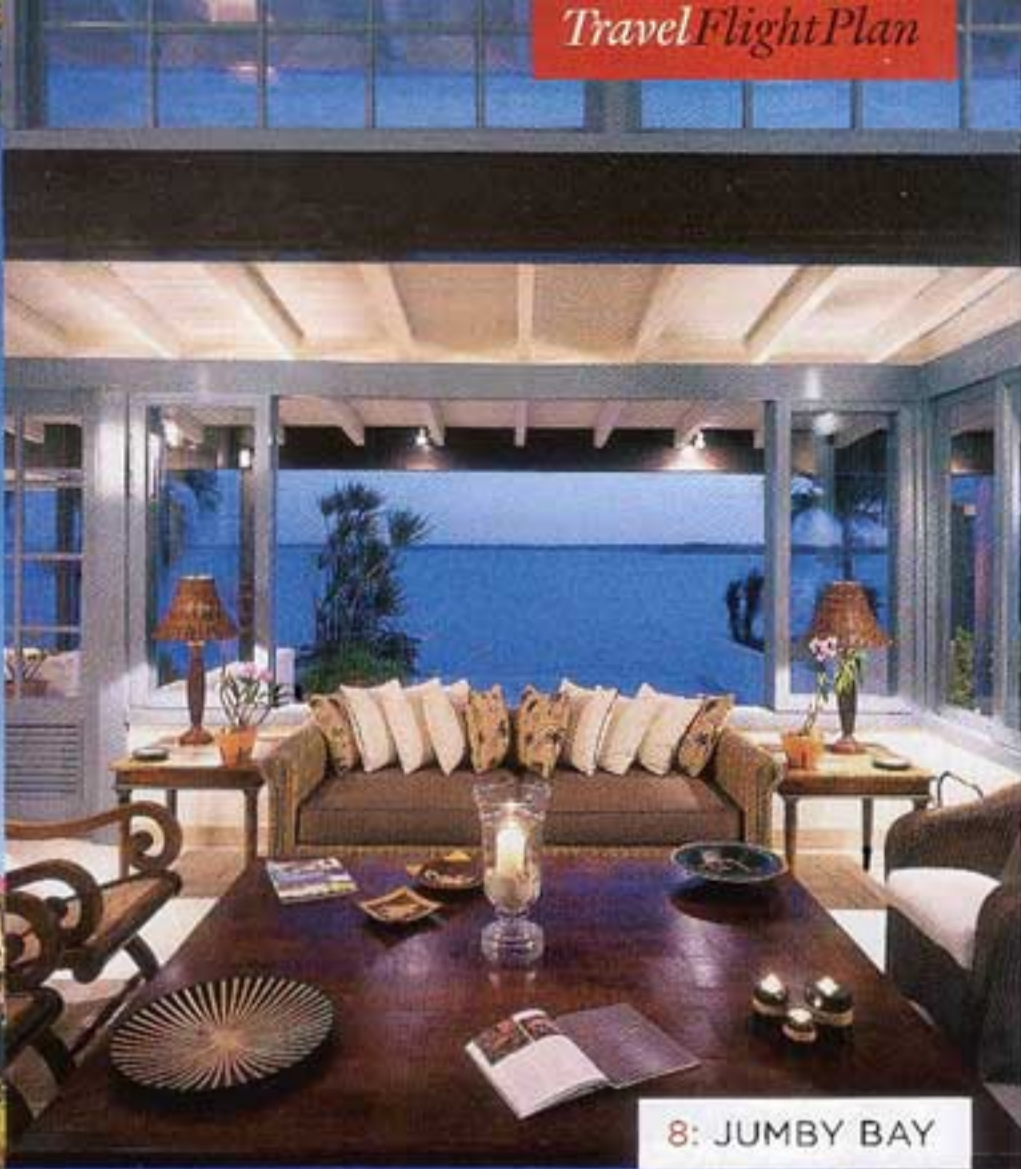
8: JUMBY BAY

Pristine reefs, custom-built dive boats and award-winning dive staff combine to make Compass Point the perfect choice for an unforgettable holiday. Seven nights, with car rental and six days' diving, from €938 pps, accommodation only; www.compasspoint.ky .