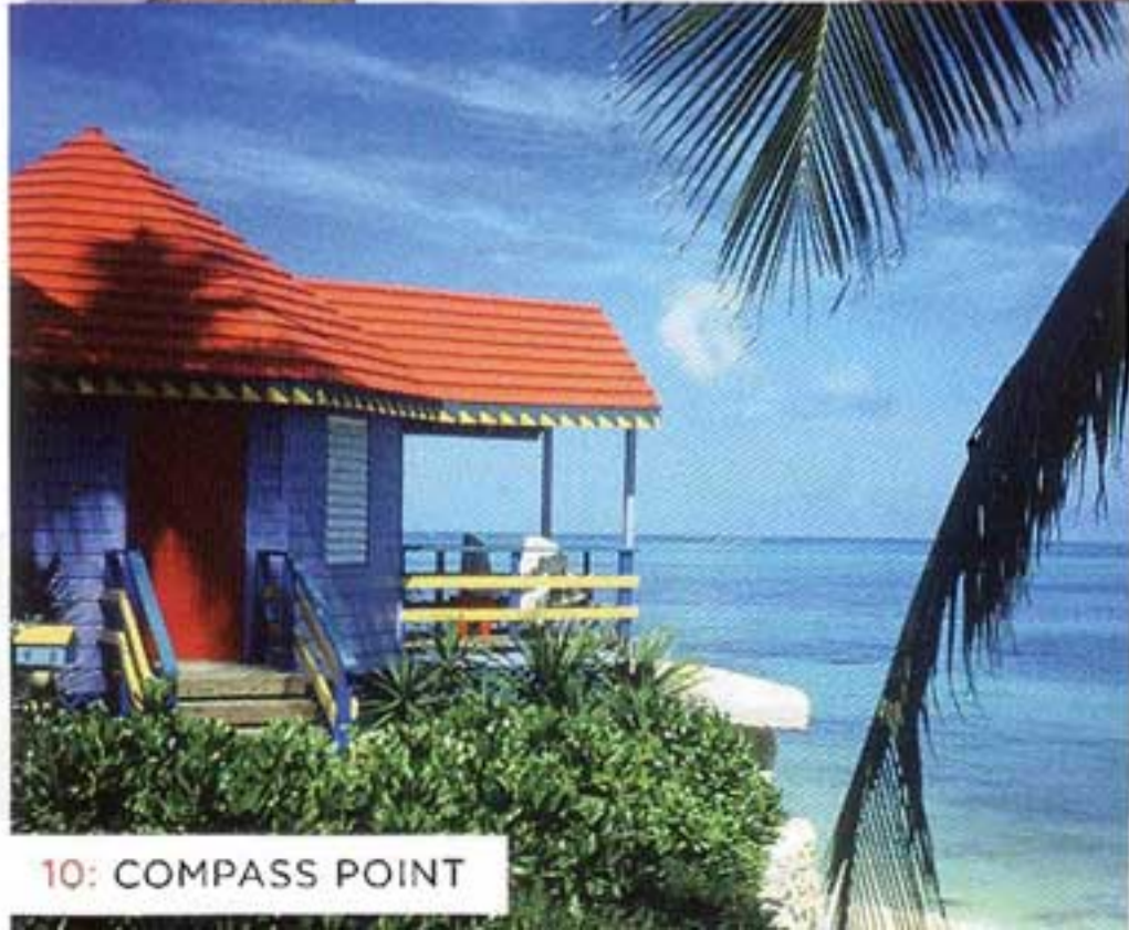
10: COMPASS POINT