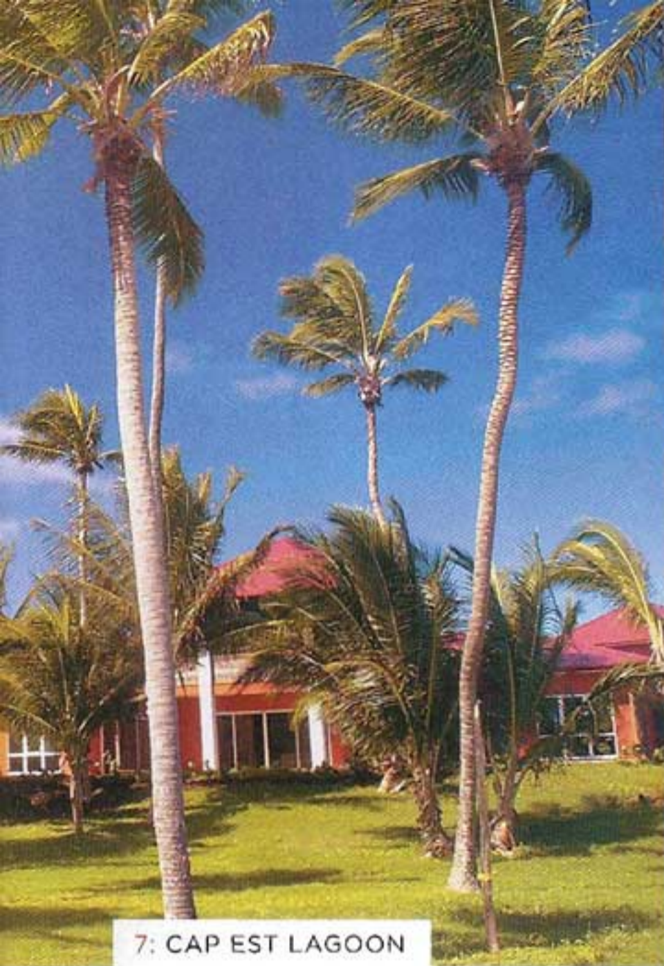
7: CAP EST LAGOON